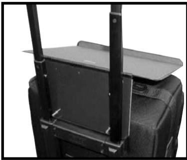
Transport Tray Placement for Installation (The handle on the Transport Case must be fully extended. Insert Tray using the guides.)