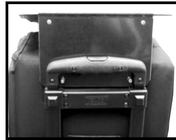
Transport Tray Locked (Close the handle on the Transport Case to lock in the laptop tray.)