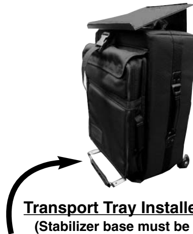
Transport Tray Installed - Full View (Stabilizer base must be fully extended when Transport Tray is in use to prevent the case from tipping over.)

1-800-631-6989 • Fax: 1-800-631-2329 e-mail: sales@pengad.com www.pengad.com