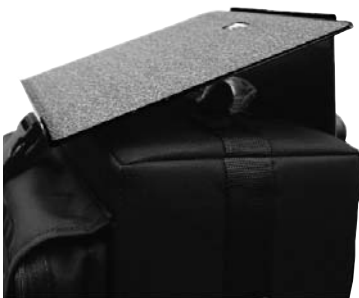
Transport Tray Installed (View of completed installation.)